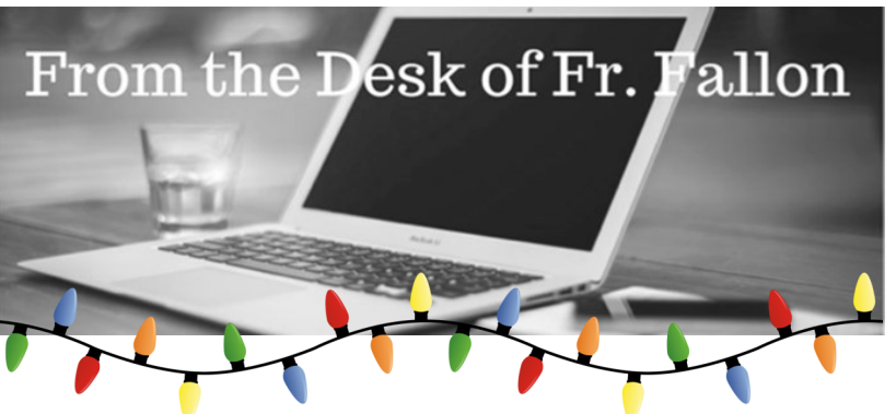
Peace be with you, everyone!

If you are homebound, sick, hospitalized, need a communion visit, please contact the office, 314.352.2111.